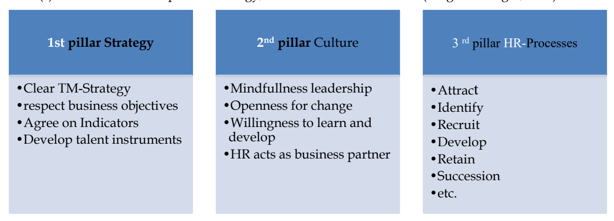
Figure 1: Talent Management Pillars

A Talent Management System is an organizational approach that deals with each staff member's talent(s). It consists of three pillars: Strategy, Culture and HR-Processes (Berger & Berger, 2004).