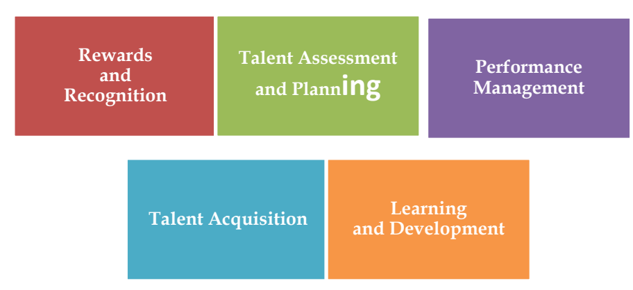
Figure 3: Talent Management Objectives

Note: Talent management: Issues of focus and fit.